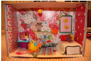
The shoe box will be like this.

We look forward to seeing your wonderful Wonka inspired designs.